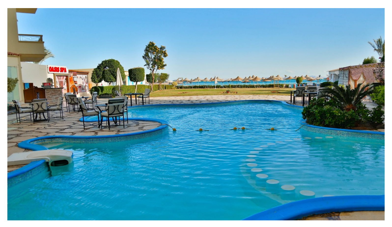
Magic Beach Hotel